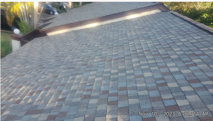
Project: STRATHMORE GATE -2937-2947 YUCCA CT / 2310-5007248-01 Date: 11/10/2023, 8:32am